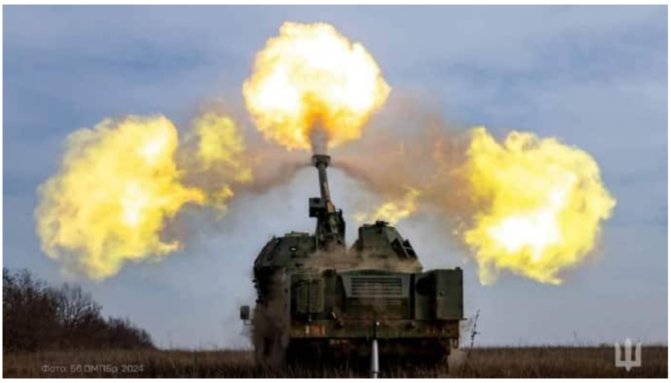
WEAPONS OF THE UKRAINIAN MILITARY